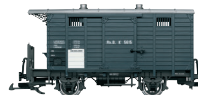
45302 RhB Boxcar