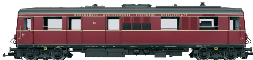
26390 Class T3 Diesel Powered Rail Car