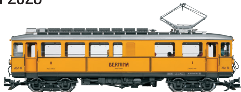
25392 RhB Class ABe 4/4 Powered Rail Car, Road Number 30