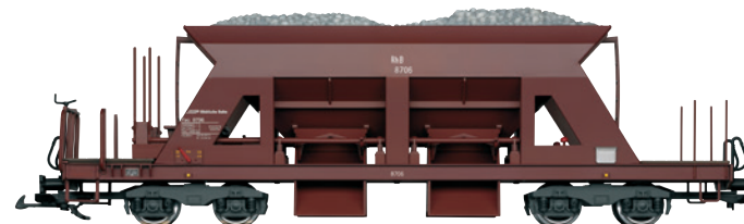
46696 RhB Dump Car