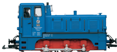
20323 MBB Class V 10C Diesel Locomotive