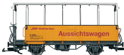
34252 RhB Observation Car