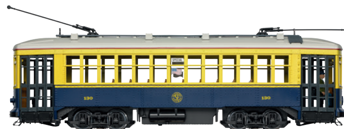
20384 San Francisco Streetcar, Car Number 130