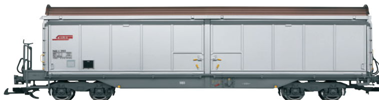
48575 RhB Type Haik-v Sliding Wall Boxcar