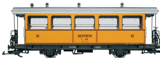
30563 RhB Bar Car, Car Number C 114