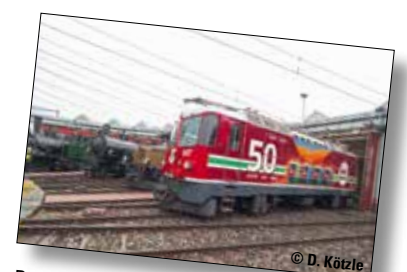
By December, the Ge 4/4 II 617 will be underway in the LGB anniversary design in the Grisons.