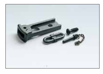
Based on an American prototype: Link-and-pin couplers included with the model

This is a model of a typical gang car as was and is in some cases still used on many North American railroads. It has finely detailed construction in a yellow paint scheme. This gang car is imprinted on both sides with typical Halloween themes. Both wheel sets are driven from a powerful motor with ball bearings. The white headlights / red marker