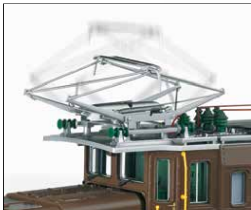
Pantographs can be raised and lowered by a motor

A typical RhB passenger train from the Sixties can be modeled together with the new 31522 and 31522 passenger cars as well as the new 34553 baggage car.